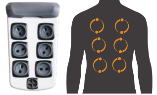
Pulsator ST Flow Rate: High