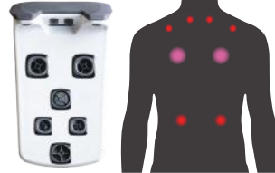
NeckEase NX Flow Rate: Medium