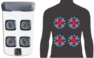
Fusion CT Flow Rate: Low