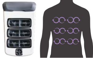
Trio ST Flow Rate: High