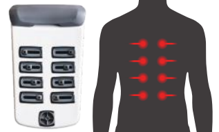
Refresh XT Flow Rate: Low