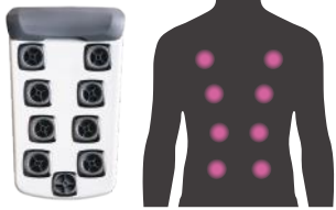
Alleviate ST Flow Rate: High