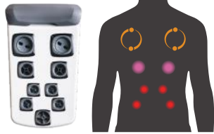
Wellness CT Flow Rate: Medium