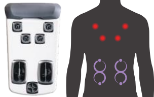
FibroTherapy CT Flow Rate: Medium