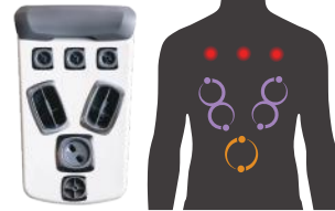
Versa CT Flow Rate: Medium