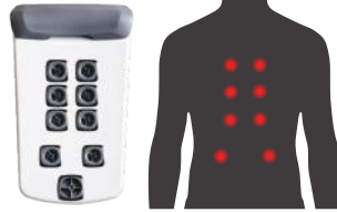
SpinalHealth ST Flow Rate: Medium