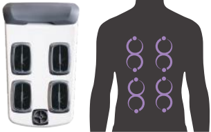
Oscillator ST Flow Rate: Medium