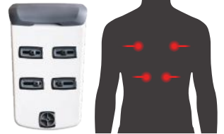
Recover XT Flow Rate: Low