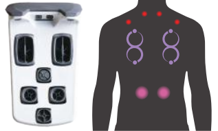
NeckPlus NX Flow Rate: High