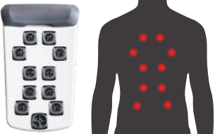
DeepRelief ST Flow Rate: High